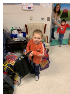
Some children receiving their backpacks from the RBA Appalachian Mountain Ministry